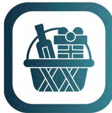
(Image is not representative of the hamper available as a lucky door prize)

Can't come to the Morning Tea & Tribute on Saturday 1 June?